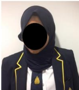
Headscarf is dark blue and although it is a looser style, the material does not go below a few inches.