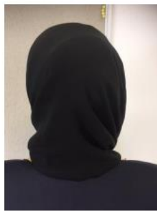
Headscarf is black and although it is not tucked in at the back, the material does not go below a few inches.