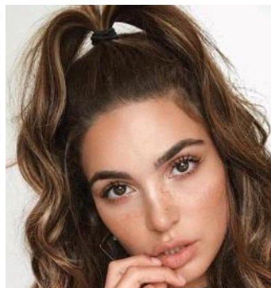
High ponytails restrict pupil view