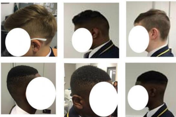
Haircuts should be even across the head