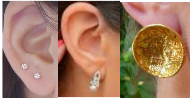
More than one